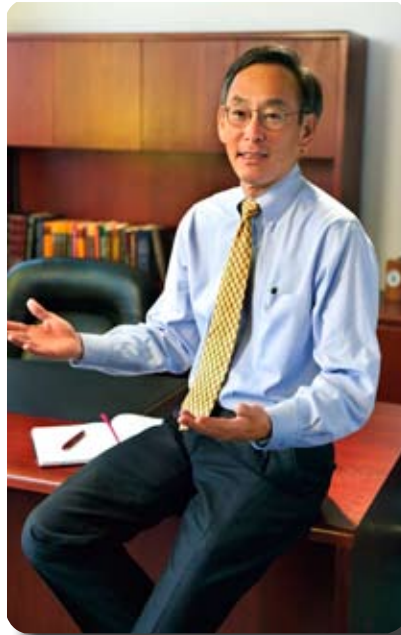
Stephen Chu, director of Berkley National Laboratory in California

In the eight-page report, the directors said they "strongly believe that nuclear energy must play a significant and growing role in our nation's — and the world's — energy portfolio." It recommended getting maximum use of the current fleet of nuclear plants while immediately deploying advanced light-water reac-